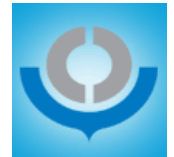
World Customs Organization