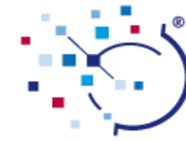
International Health Terminology SDO