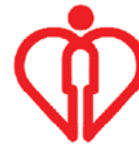
HONG KONG HOSPITAL AUTHORITY