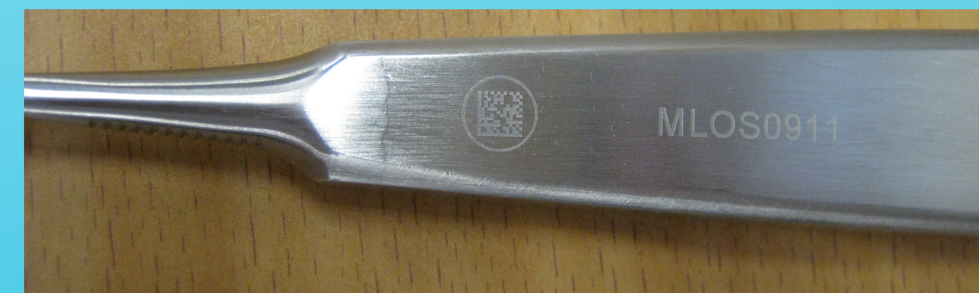
GS1 keys used GTIN (01) + serial number (21)

The Hospitals in Finland were using their own internal numbers to identify instruments. They were also adopting different technology depending on the size of the hospital. The biggest ones are now using RFID whereas the majority of hospitals use barcodes. Some of the smallest hospitals still rely on Human Readable Information because they lack the resources to upgrade their systems. This made it a problem for hospitals to identify instruments if they got borrowed from another hospital.